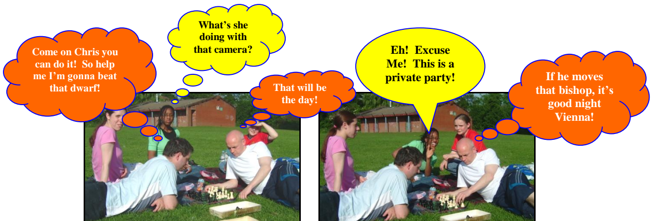
Some of the DG relaxing at a local park!