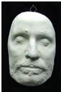
Oliver Cromwell's Death Mask!

Take for example Oliver Cromwell. Cromwell was a devout Christian who read and lived the Scriptures daily. He is in Heaven right now as you are reading this booklet because he asked the Lord Jesus Christ to forgive him of all his sins! We are