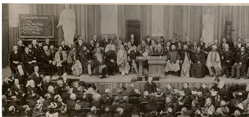
Parliament of the World’s Religions Chicago Meeting 1893