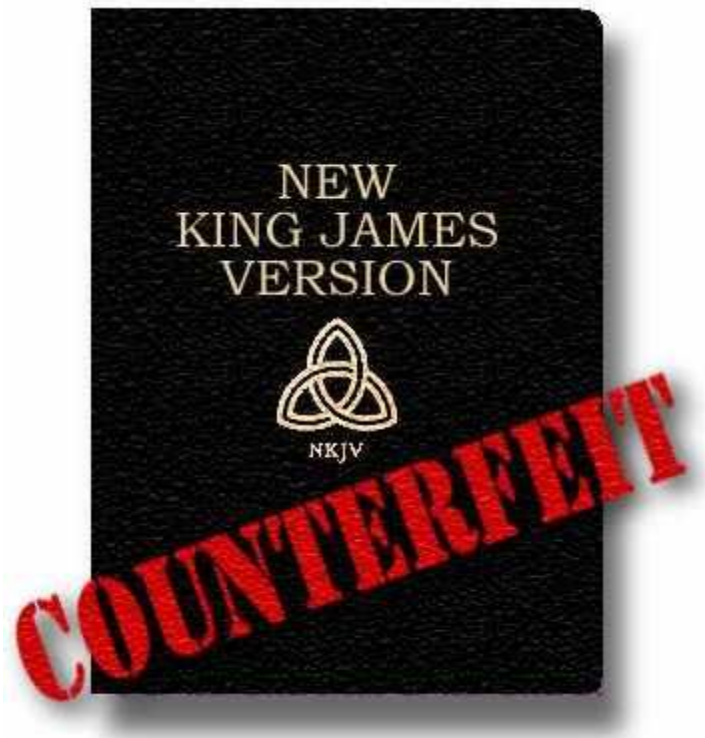
Figure 3 The Devil's Counterfeit – the NKJV and its Masonic Logo