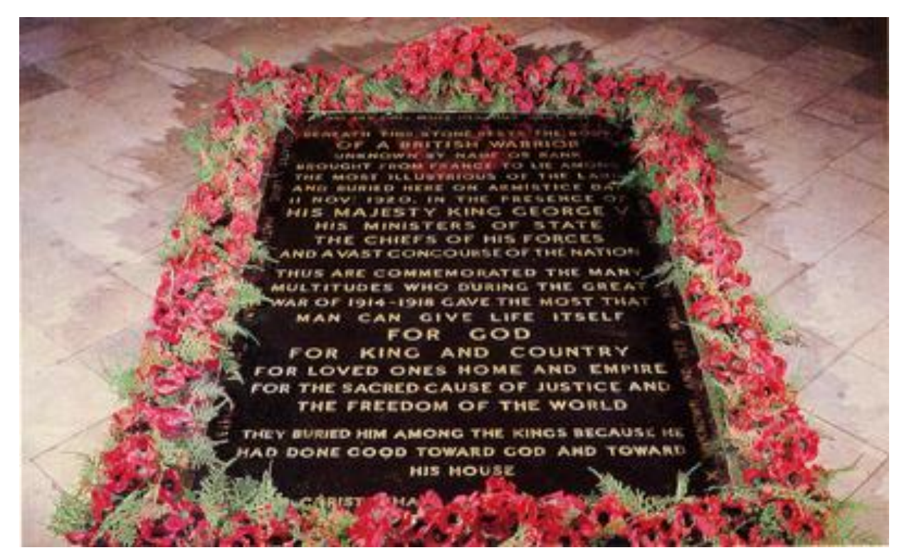
The Tomb of The Unknown Warrior, Interred Westminster Abbey, November 11<sup>th</sup> 1920, <u>en.wikipedia.org/wiki/The_Unknown_Warrior</u>

Portions of five Texts of scripture are inscribed on the black marble gravestone. Four are arranged around the edges of the gravestone.