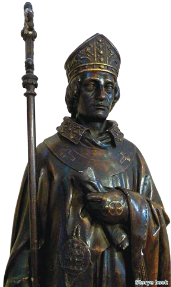
Stephen Langton Archbishop of Canterbury 1207-1228

Chapter-division was apparently the right idea at the right time, and one of the remarkable things about the Langtonian chapter divisions is how they were adopted and propagated by different scholarly communities. Jewish scholars (who had worked with other methods of division previously) soon began observing Langtonian chapter divisions, and the churches of the Christian East took the same divisions over in their biblical studies...