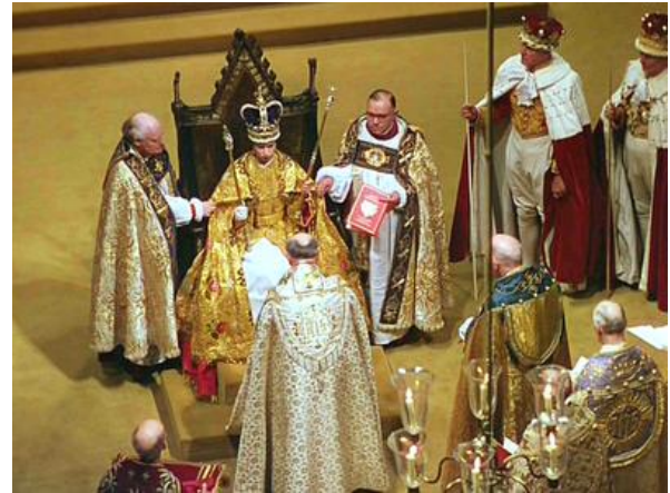
The Queen Enthroned with “The Royal Law”