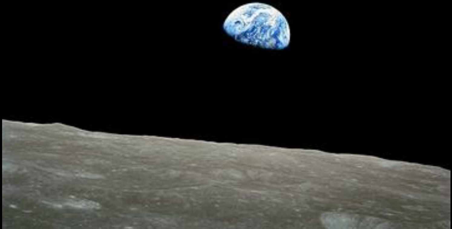
Earthrise - from Apollo 8, "And God made the firmament" Genesis 1:7