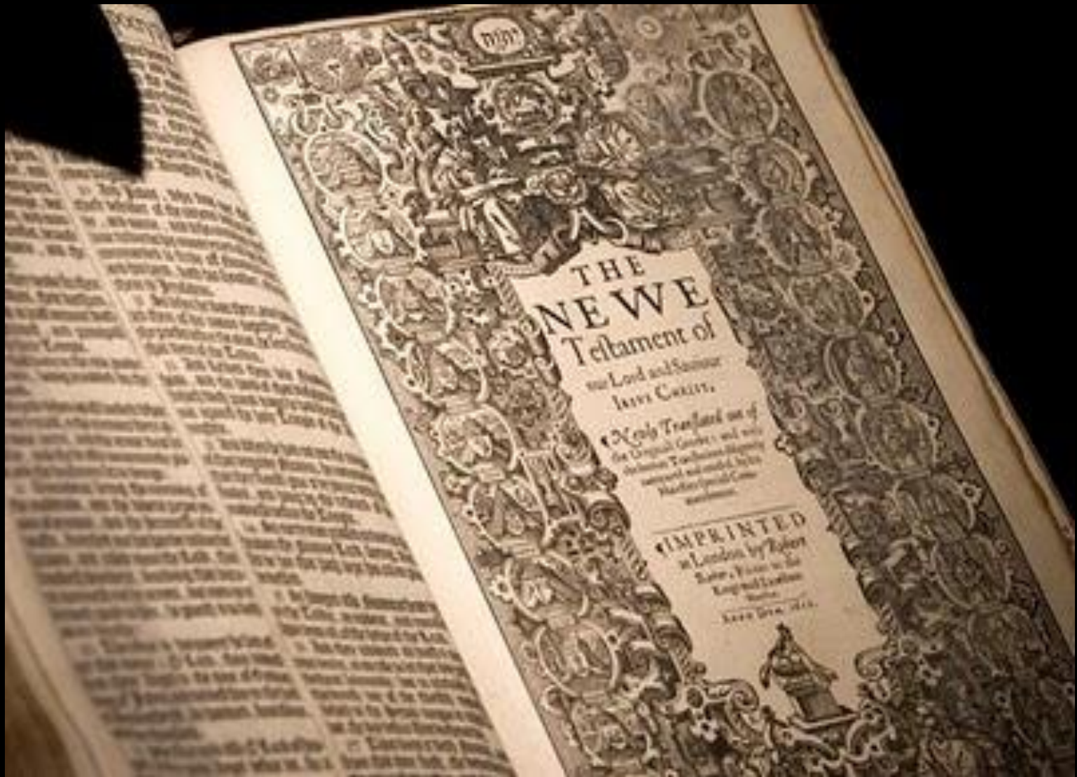
The 1611 KJB New Testament Title Page