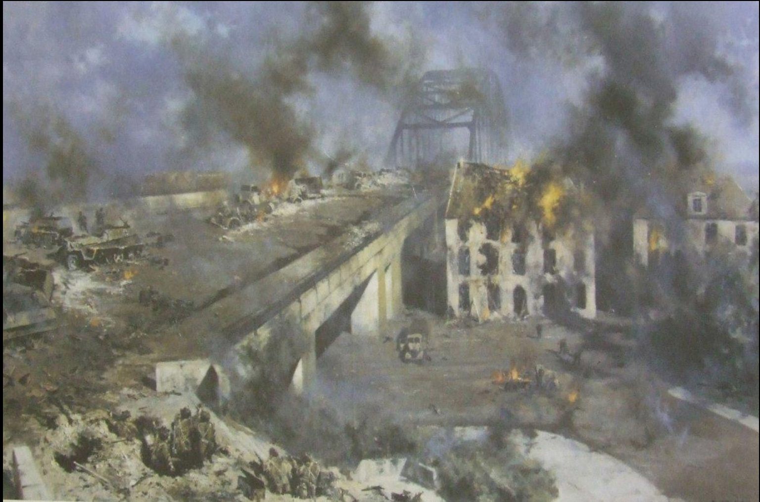
A Bridge Too Far – Battle of the Arnhem Road Bridge