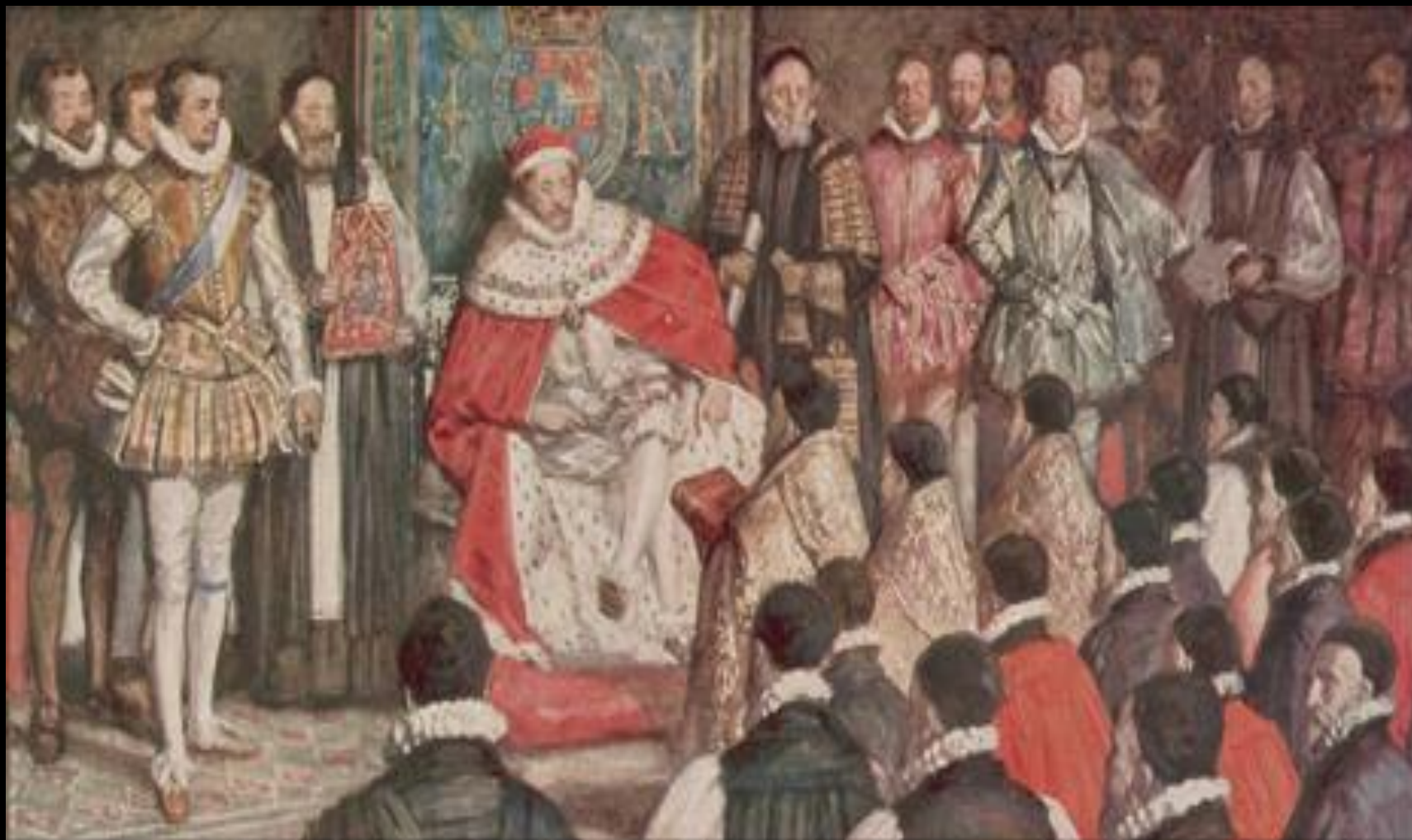
King, Bishops and Puritans at Hampton Court, January 1604