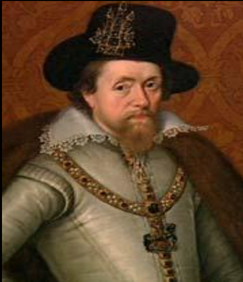
King James 1 st of England