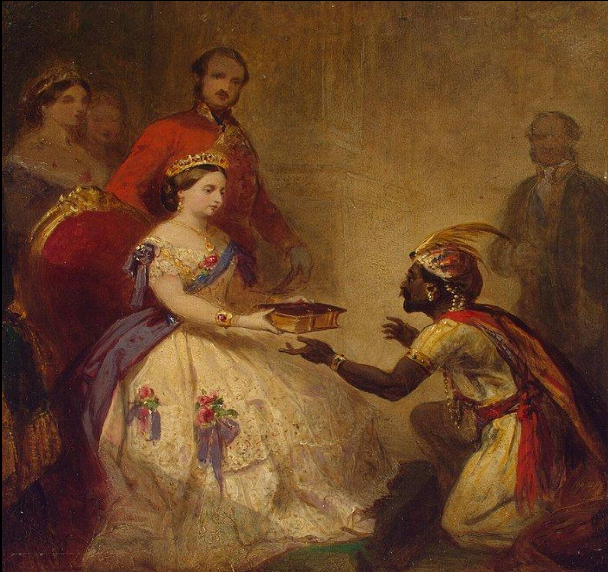
“That Book accounts for the supremacy of England” – Queen Victoria