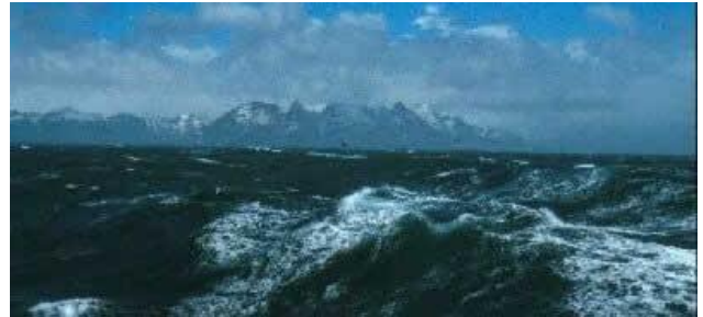
The Southern Ocean

Ironically, God's provision of salvation for today's pilgrim is illustrated by the discovery of Scott's last camp in November 1912 after the Antarctic winter had subsided so that the search party could set out. The camp lay only 11 miles from the major supply depot that would have saved the lives of Captain Scott and his two last companions, Dr Edward Wilson and Lieutenant Henry Bowers.