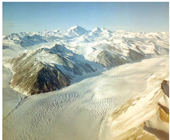
The Beardmore Glacier 1956

The South Geographic and Magnetic Poles are located on the great polar plateau. Unaware of Amundsen's pioneering route Scott and other early polar explorers got up onto the plateau via the Beardmore Glacier 3 that stretches for 125 miles and descends over 7000 feet from the plateau to the Ross Ice Shelf. The round trip for Captain Scott and his men from their base camp to the South Geographic Pole and back would have been almost 1900 miles, often over very hard terrain and as stated in daunting weather.