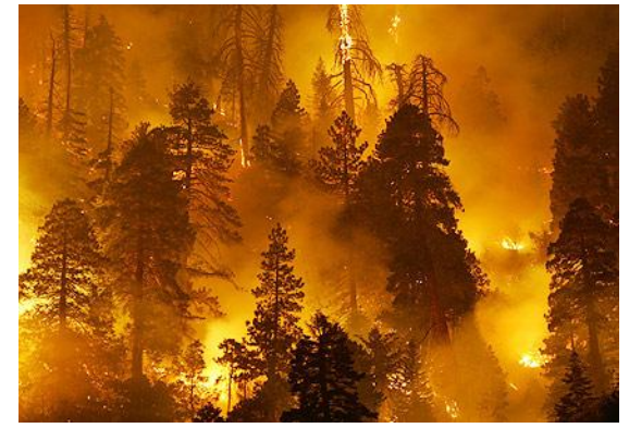
The Fire of Jeremiah

Jeremiah 21:14 is therefore a grim warning for Britain.