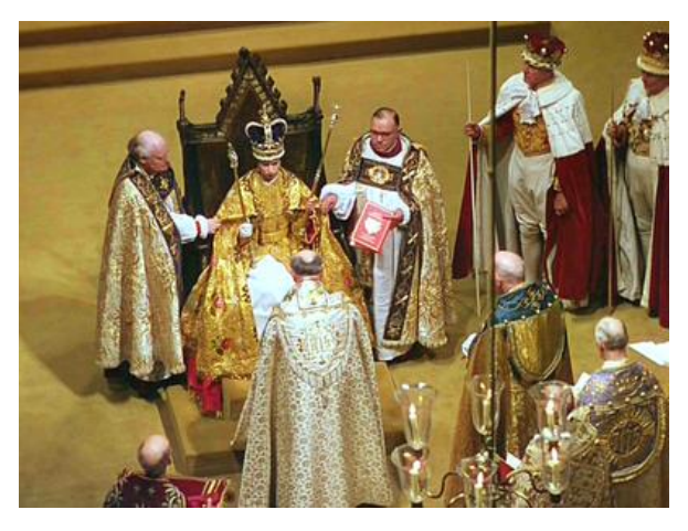
The Queen Enthroned with "The Royal Law"