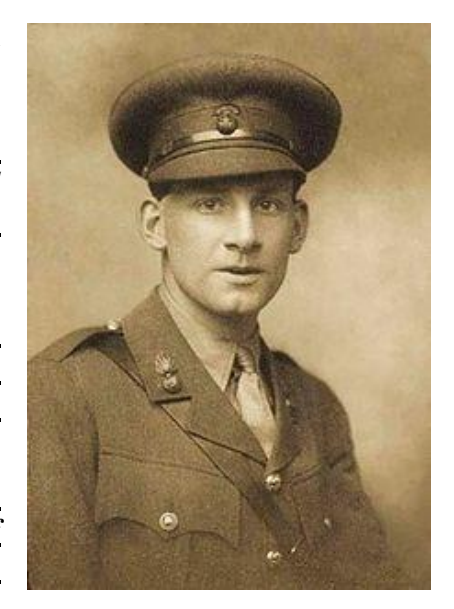
Siegfried Sassoon (May 1915)

It was the Lord Jesus Christ that "resisted unto blood, striving against sin." Therefore today's believer can plead "the blood of Christ" against any sin and overcome it insofar as "How much more shall the blood of Christ, who through the eternal Spirit offered himself without spot to God, purge your conscience from