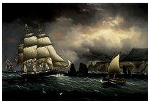
The Clipper Ship “Flying Cloud” off the Needles, Isle of Wight, on the southern English coast. Painting by James E. Buttersworth.

“Now consider this, ye that forget God, lest I tear you in pieces, and there be none to deliver” Psalm 50:22. Some heed that warning. See below.