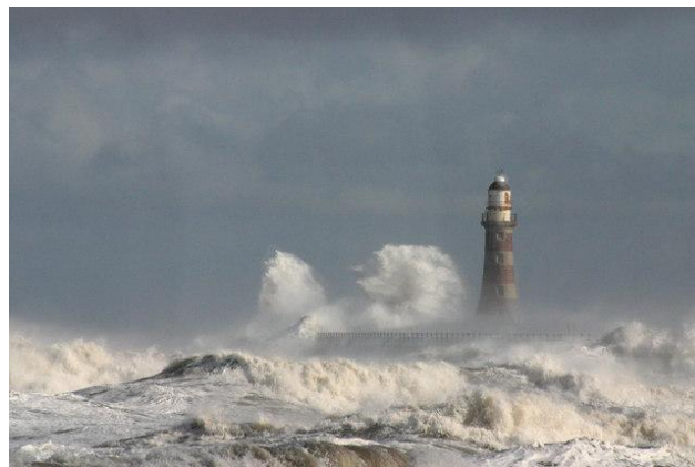
Roker Lighthouse, Sunderland

www.youtube.com/watch?v=bDjwUzUnNpU en.wikipedia.org/wiki/Eternal_Father,_Strong_to_Save .