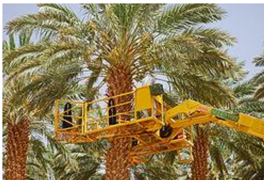
Date harvest in Israel

For now, it seems that Israel is enjoying something of Deuteronomy 28:1-9 with a partial fulfilment of Isaiah 35:1 “The wilderness and the solitary place shall be glad for them; and the desert shall rejoice, and blossom as the rose.” See these extracts from en.wikipedia.org/wiki/Agriculture_in_Israel .