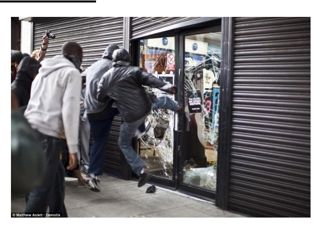
Cain, London 2011

"Being justified freely by his grace through the redemption that is in Christ Jesus: Whom God hath set forth to be a propitiation through faith in his blood, to declare his righteousness for the remission of sins that are past, through the forbearance of God" Romans 3:24-25.