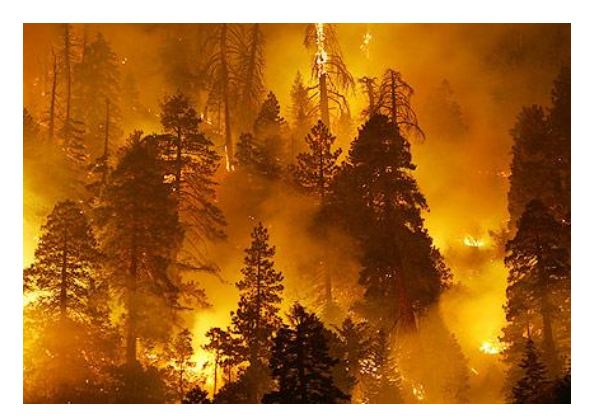
The Fire of Jeremiah

Britain must therefore regain her only firebreak "the royal law" the AV1611 to receive mercy when God's End Times judgement by fire finally descends "that the whole nation perish not" John 11:50.