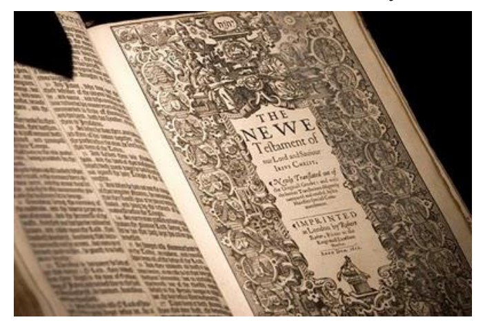
"The Royal Law" James 2:8