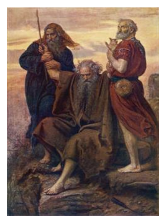
"The LORD will have war with Amalek" Exodus 17:15 communio.stblogs.org/spiritual-life/2010/10/

"That men may know that thou, whose name alone is <u>JEHOVAH</u>, art the most high over all the earth" Psalm 83:18.