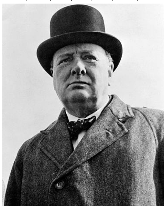
Prime Minister of the United Kingdom en.wikipedia.org/wiki/Winston Churchill

The Right Honourable Sir Winston Churchill KG, OM, CH, TD, DL, FRS, RA