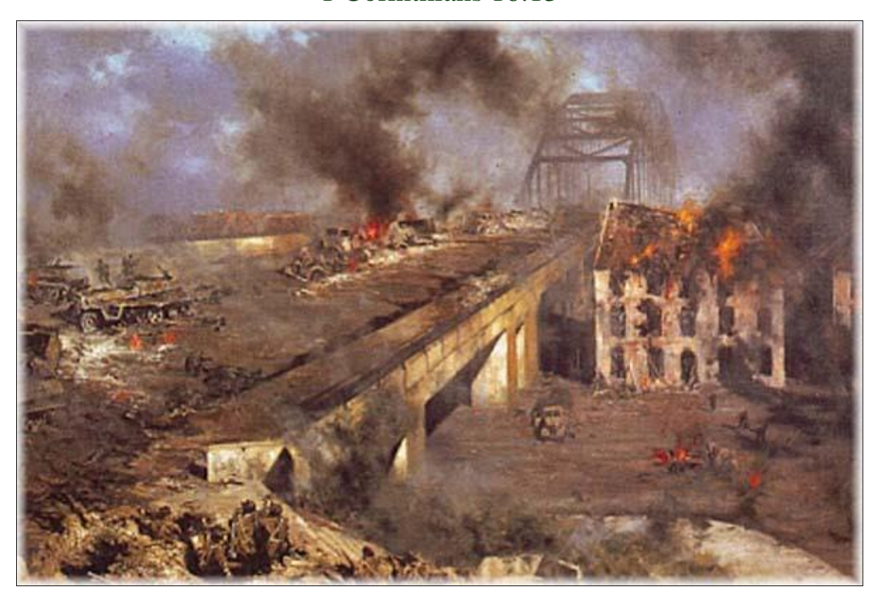
"Out of ammunition. God Save the King" Arnhem Road Bridge September 1944