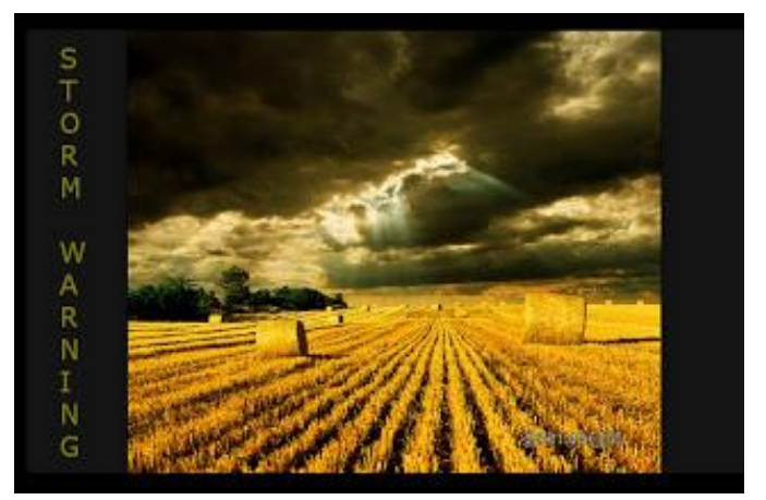
Reaping the Whirlwind the-ten.blogspot.co.uk/2013/07/reaping-whirlwind.html

"For they have sown the wind, and they shall reap the whirlwind..." Hosea 8:7