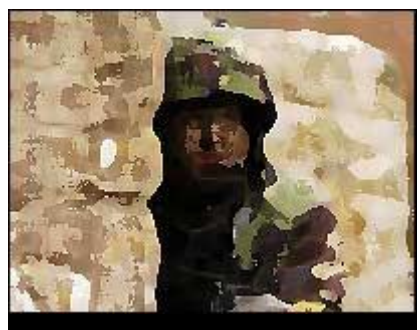
An artist's impression of a soldier in wartime

www.bbc.co.uk/stoke/features/2005/02/sound of battle.shtml