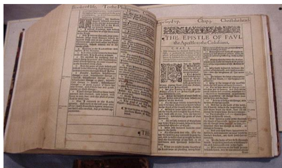
The Authorized 1611 King James Holy Bible

Philippians 2:16 states “ Holding forth the word of life , that I may rejoice in the day of Christ, that I have not run in vain, neither laboured in vain. ” Inspiration must be inviolate throughout the purification process of “ the word of life ” otherwise it is no longer “ the word of life ” and Paul and the other writers of scriptures would have run and laboured in vain. However, they did not, because “ the word of the Lord endureth for ever ” 1 Peter 1:25. An overview of the seven-stage purification sub-processes embedded in the overall purification process.