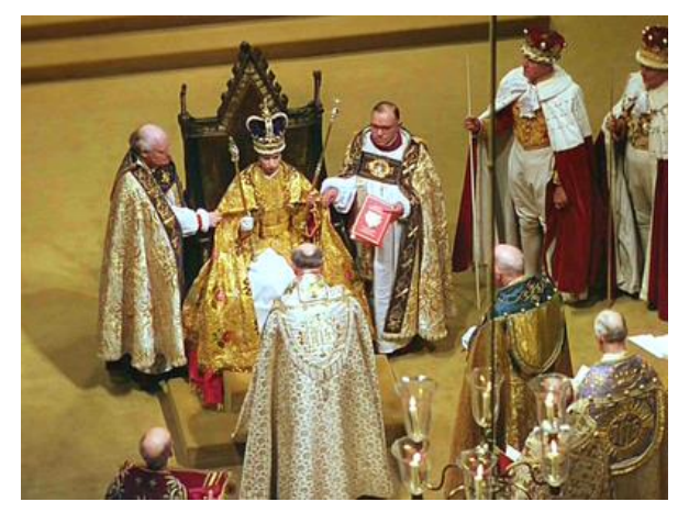
The Queen Enthroned with "The Royal Law"