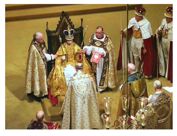
The Queen Enthroned with "The Royal Law"