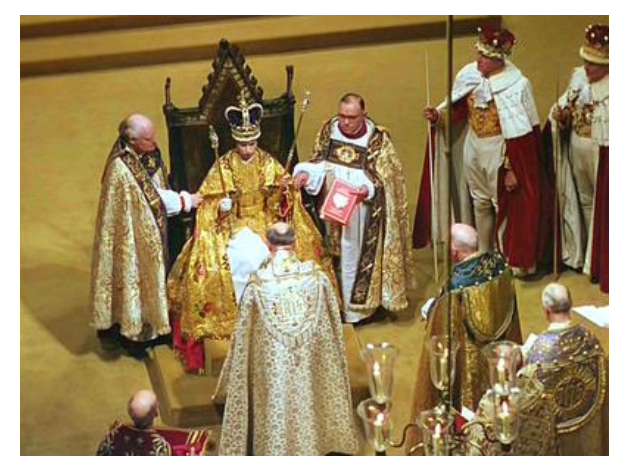
"The Royal Law" James 2:8