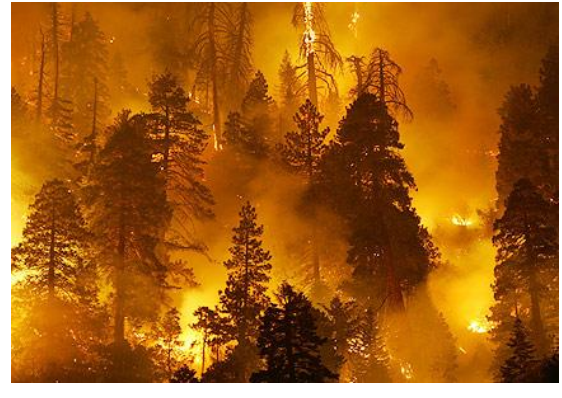
The Fire of Jeremiah

God promises a judgement by fire in the End Times. "And <u>I will send a fire</u> on Magog, <u>and among them that dwell carelessly in the isles:</u> and they shall know that I <u>am the LORD</u>" Ezekiel 39:6.